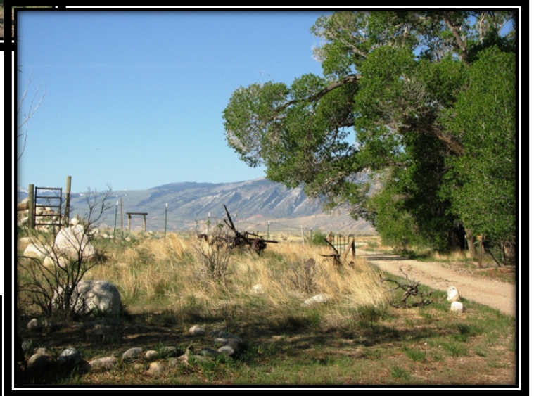
Tree Lined Driveway